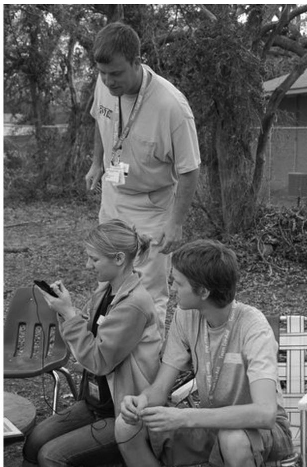
Team Epi-Aid student volunteers and graduate students in the Department of Epidemiology at UNC SPH receive training on using handheld computers for field data collection in Mississippi following Hurricane Katrina.

Team Epi-Aid students can be deployed quickly to provide just-in-time response. Announcements requesting volunteers are sent out via a Team Epi-Aid e-mail listserv and NCCPHP maintains a Team Epi-Aid database of all volunteers that includes the name, UNC department, computer skills, language skills, type and